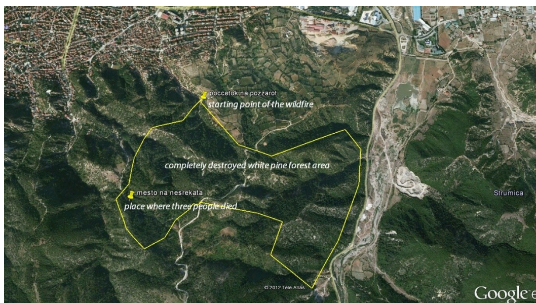
Picture 2: affected forest with white pine in one day – approximately 300ha

The area of 400ha covered with endemic white pine forest was completely destroyed. Due to the immediate threat to the city, citizens were mobilized and provided voluntary support to the local and national institutions to put the fire under control.