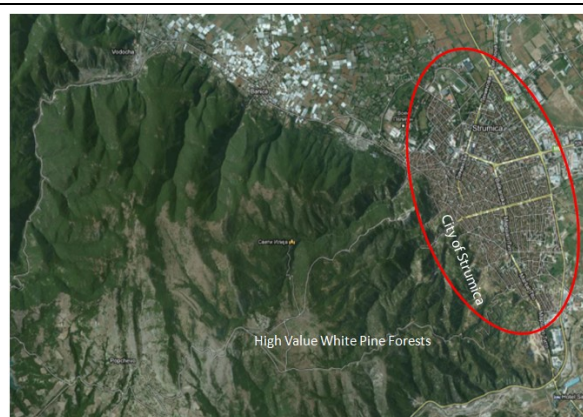
Municipality of Strumica South-Eastern part of FYR Macedonia.

Population: 54,636 inhabitants, of which city of Strumica: 35,311 inhabitants (census 2002) Temporarily evacuated population: 10,000 Displaced population: 1,400 Displaced Roma population: 1,200 Unemployment rate: 40.52% Area: 322 square kilometres. Elevation: 256 m Mountains: Belasica (1883 m), Ograzden (1746 m), and Elenica ( 970 m ) Rivers: Strumica ( 34,50 km ) , Vodocha ( 20,50 km ) , Turija ( 9 km ) Trakajna ( 4.96 km ). Climate: Mediterranean. Sunny days: 230 days, or 2370 hours annually. Rainfall: 600 l /m 3 Wind: north-westerly and south-westerly.