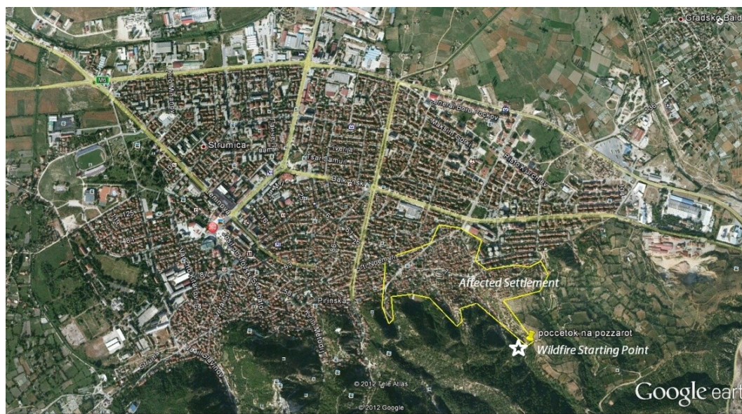
Picture 1: The starting point of the wildfire and 100 houses under immediate threat (end point of the city)

where approximately 1,000 mixed Turkish and Roma people live has faced immediate threat. The wildfire has also affected the regional road, disrupting trade and commerce. The municipality is taking care for covering their current needs.